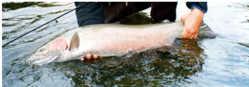
North Country Wild Steelhead