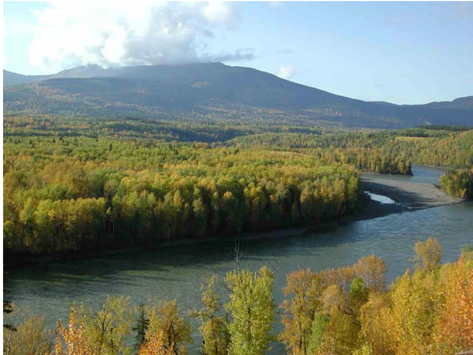
Skeena River, BC